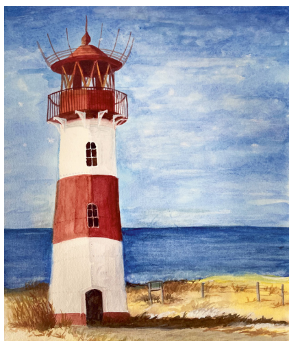
Brochure cover "Lighthouse" by Shiona Shui HKCC Art of Watercolour student. Class tutor Cheree Connolly.